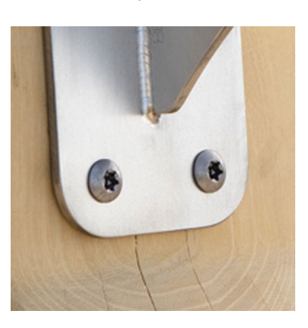
Stainless steel screws and/or screws covered with plastic caps,