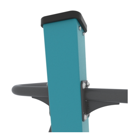
Powder galvanized and powder-coated or stainless steel construction of 100 \times 100 mm profile, dulrable end caps on the top of the structure made of plastic,