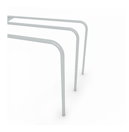
Stainless steel bars with a diameter of 38 mm for a comfortable grip during exercises.