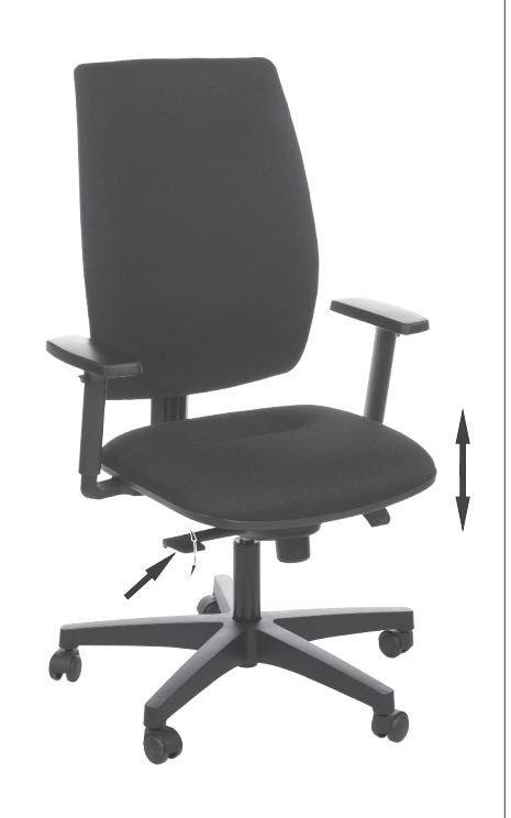
Height adjustment of the seat