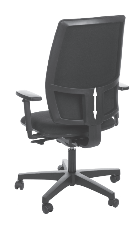
Height adjustment of the lumbar support