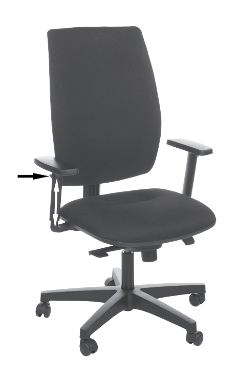
Height adjustment of the armrest