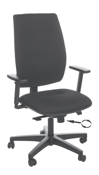
Tension adjustment of back inclination