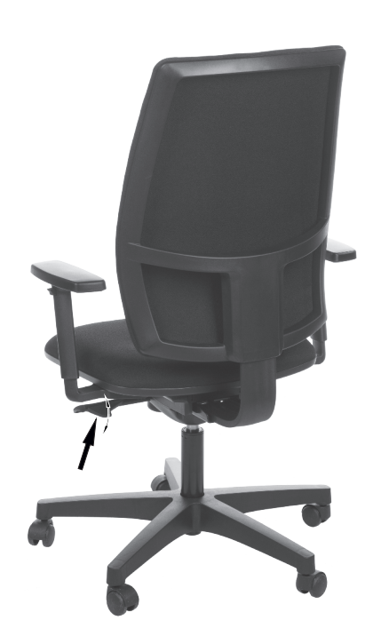
Depth adjustment of the seating