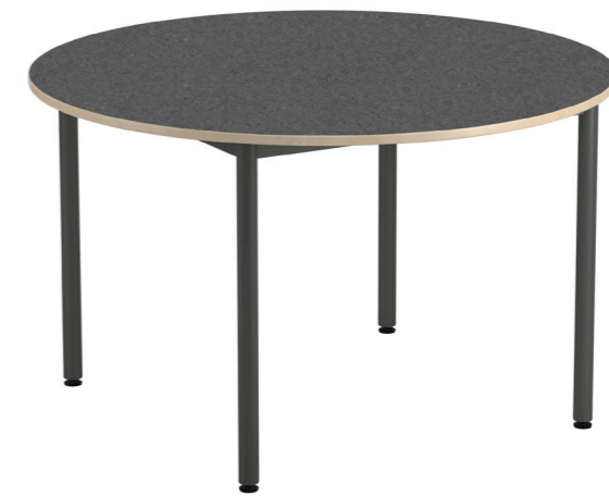
12:38 Linoleum round

Top in standard HPL range Natural Oak and stand in standard color range RAL 9005