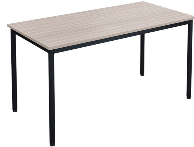
12:38 HPL rectangular

12:38 table family has a wide variety of sizes, heights and tabletops to be able to meet all the needs in the school environment. The table has a metal frame available in 3 standard colors and 27 premium colors. The tabletops are available in linoleum, high pressure laminate and laminate. The natural material linoleum dampens sound and creates a quieter sound environment in the room. Laminate provides an impact- and scratch-resistant surface. If more sound absorption is desired an acoustic optimal core is available.