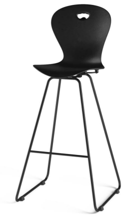
Bar stool Available in large seat (H68/H78) or medium seat (H68/H78).