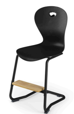
C-stand footrest Available in large seat (H45/H50/H65) or medium seat (H45/H50).