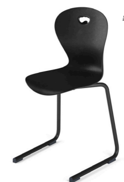
D-stand Available in large seat (H45) or medium seat (H45).