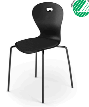
4 leg Available in large seat (H45) or medium seat (H37). Also available with armrest.