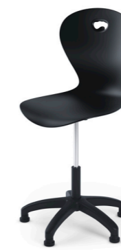
5 cross plastic Available in large seat (H38-50/H50-70) or medium seat (H38-50/H50-70). With wheels or sliding feet.