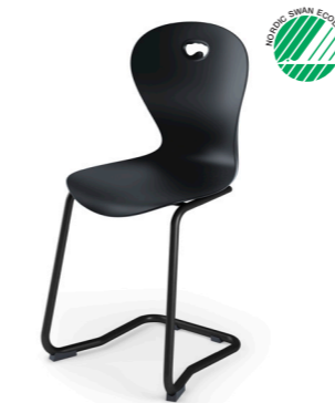
C-stand Available in large seat (H45) or medium seat (H45).