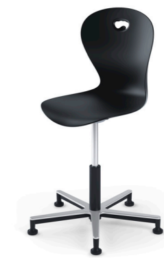
5 cross aluminum Available in large seat (H38-50/H50-70) or medium seat (H38-50/H50-70). With wheels or sliding feet.

SEAT & BACK SEAT IN 100% RECYCLED PLASTIC