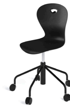
5 cross metallic Available in large seat (H46-57) or medium seat (H46-57).