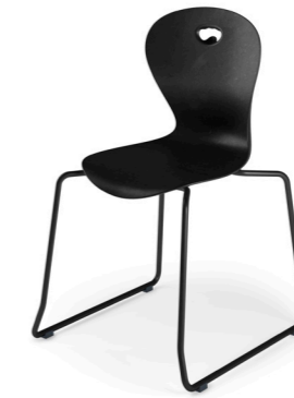
Skids Available in large seat (H45) or medium seat(H45). Also available with armrest.